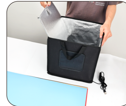
3. Put in the firm panel