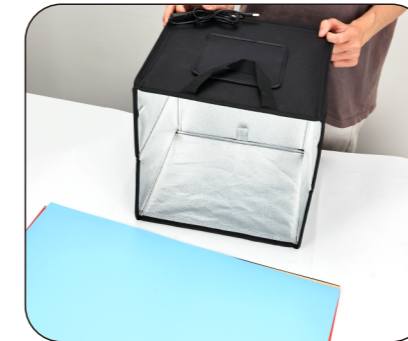
4. Assembly complete