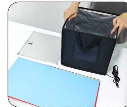
2. Open photo booth