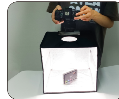
6. Taking pictures