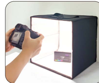
5. Connect power and place object in the booth